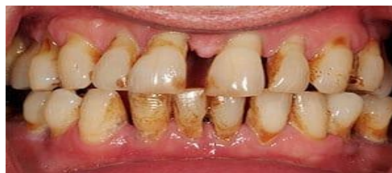
Figure (1- 2): Chronic periodontitis

The removal of calculus, management of plaque, and control of gingivitis are crucial in preventing the advancement of periodontitis, further attachment loss, and eventual tooth loss. (Ramseier et al. , 2017).