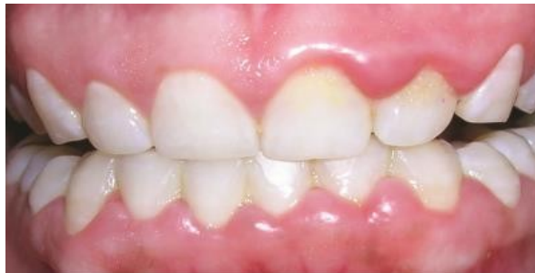
Figure (1-1): Plaque induced gingivitis (Bathla, 2017) .

When compared to periodontitis, a peculiarity of plaque-induced gingivitis is the complete reversibility of the tissue alterations once the dental biofilm is removed. Notwithstanding the reversibility of the gingivitis-elicited tissue changes, gingivitis holds particular clinical significance because it is considered the precursor of periodontitis, a disease characterized by gingival inflammation combined with connective tissue attachment and bone loss (Trombelli et al. , 2018) .